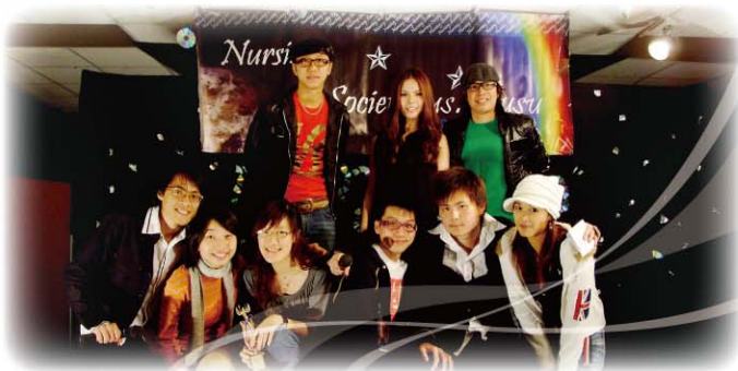
A&E in the NUR "SING" contest

Last but not least, we want to thank staff of the Department and the external bodies for their support and participation of all the members. Without this, our NUR "SING" contest would not have been so successful.