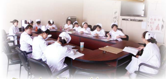
Discussing the medical cases with the mentor