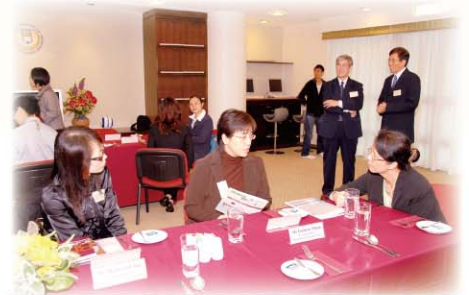
Sharing of ideas and experience at the luncheon