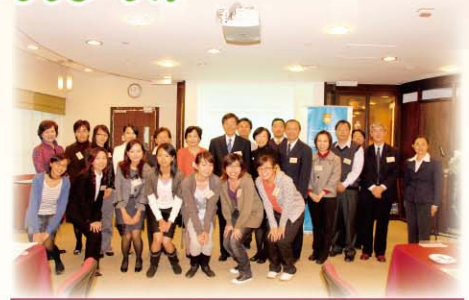
A group photo of our guests, colleagues and nursing students at the luncheon on 26 Nov 08.

The Luncheon served several purposes. Firstly, it enabled teachers from the participating schools had gained a better understanding of the BN(FT) curriculum as well as the nursing profession through our introduction and discussions with them. Secondly, it provided a meaningful channel for all parties to exchange ideas on current education policies and share similar concerns on students' learning issues. It also helped establish a positive collaborative relationship between the participating schools and our department. It was encouraging to see some teachers joining our luncheon again this year and giving us much support, and we would continue to work closely with them in nurturing our new generations.