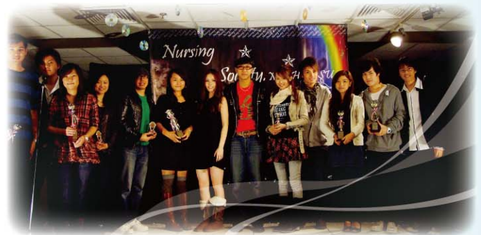
Guests, judges and winners of NUR "SING" contest

Although the session of A&E has ended, we believe that Nāvitās of the next session can do much better and serve members wholeheartedly in this year.