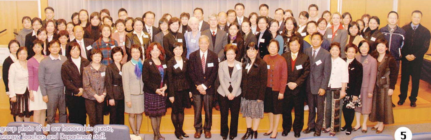
A group photo of all our honourable guests, Honorary Teachers and Department staff.