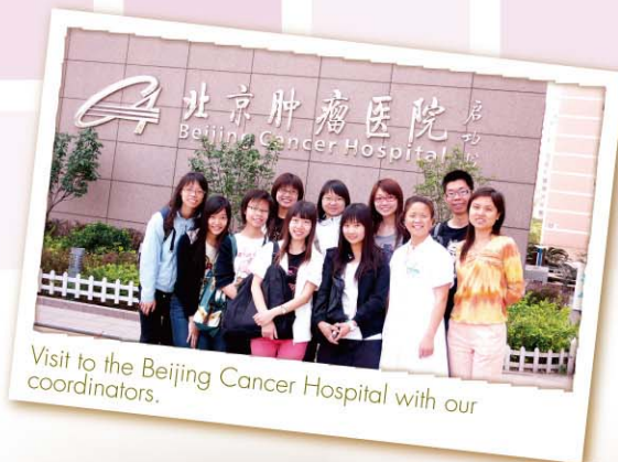
Visit to the Beijing Cancer Hospital with our coordinators.

This exchange programme was really a great opportunity to learn about the health care system of Beijing and allowed us to explore our world by meeting people of different attitudes and values.