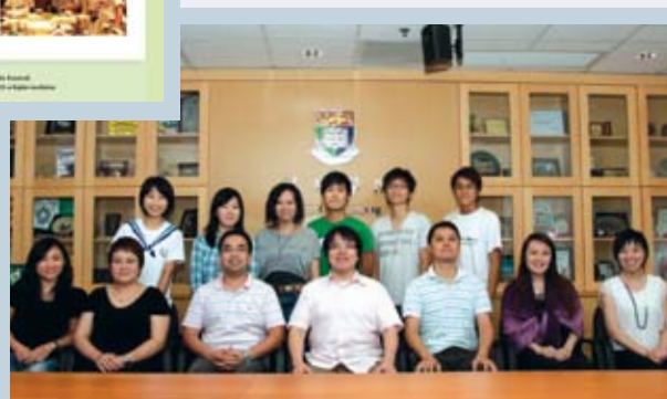
▲ A group photo of the members of existing executive committee (front row) and newly-established student sub-committee (back row)

In the coming days, with the injection of new blood, we are sure that the Association will have its scope of services extended and strengthened.