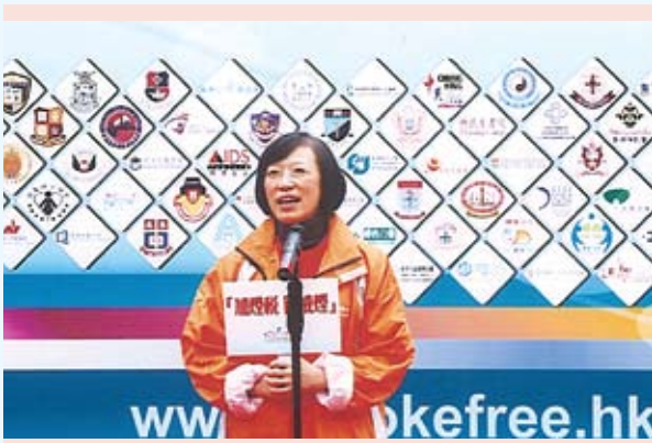
▲ Professor Sophia Chan presented her support to assist smokers in quitting smoking.

Staff and students of the School support tobacco tax increase and participated in the press event for the "Raise Tobacco Tax Campaign" organized by the Hong Kong Council on Smoking and Health (COSH) on 16 January 2011. The Group suggested raising tobacco duty as a means of encouraging people to reduce or stop smoking.