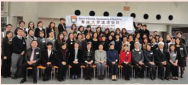
▲ Group photo taken during the visit at School of Nursing, Tokyo Metropolitan University

We were deeply impressed by the Japanese culture, language, cuisine and people and greatly enjoyed our stay in Tokyo.