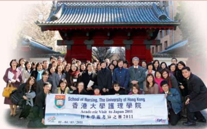
▲ A photo taken in front of the School of Nursing, the University of Tokyo

In view of the problems related to the declining birthrate and aging population, and the sudden increase in the number of patients with chronic diseases, the health care service in Japan focuses on the maintenance and advancement of health to extend healthy and long life. Apart from meeting the faculties and students, the academic visit enabled us to learn more about the local health care system and nursing research by attending lectures on "The Health Care System in Japan" and