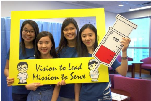
Photo Booth – Captured the best moment!

At the Information Day, there was an area decorated with the theme - Pursuing your dream of nursing in HKU! Our students helped visitors to capture the best memories in the photo booth, where they enjoyed photo taking with their family and friends.